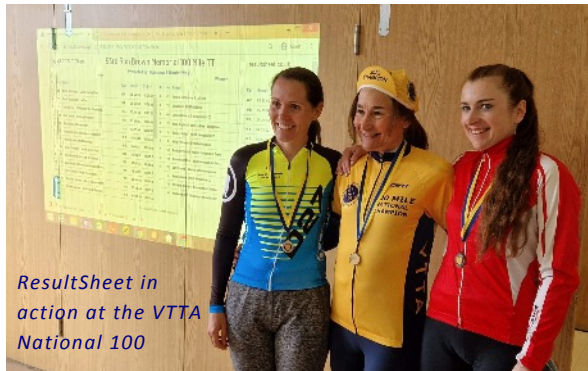
ResultSheet in action at the VTTA National 100

Once the event is complete and any queried times are corrected, organisers can export results and upload them to the CTT website without needing to rekey any data. The steps for club events are the same except the start